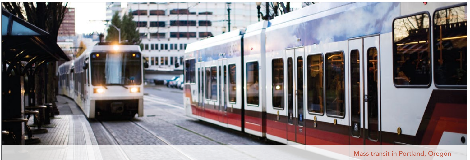
Mass transit in Portland, Oregon

Ultimately, the carbon impact of employees' commutes is one of many factors in the search (other factors are viewable at http://neesuitesearch.wordpress.com/whats-important-in-an-office-space/ ), but it carries considerable weight because of NEEA's organizational commitment to transit, bike accessibility, and sustainability. Would other organizations need to go through this thorough of an analysis? Maybe not, unless they were tracking and reporting carbon emissions at an organizational level – in which case it would be imperative.